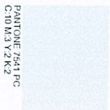
PANTONE 7541 PC C:10 M:3 Y:2 K:2